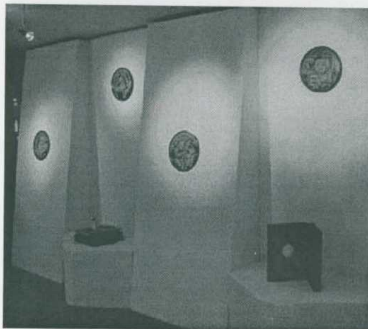
Exhibition View, "READ!", 2002

Inspired by the British Council Library's traditional reading space to a multi-functional operates as both a library as well as an exhibition aims to establish the relationship physical space and its 'community' of users.